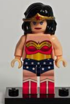
LESLIE ZARUBIN EXT 2 AKA WONDER WONMAN!